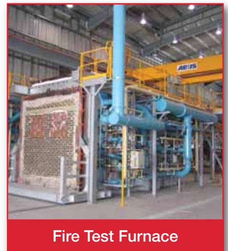
Fire Test Furnace